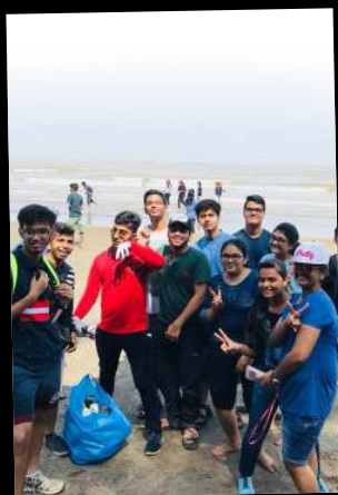
BEACH CLEANING DRIVE