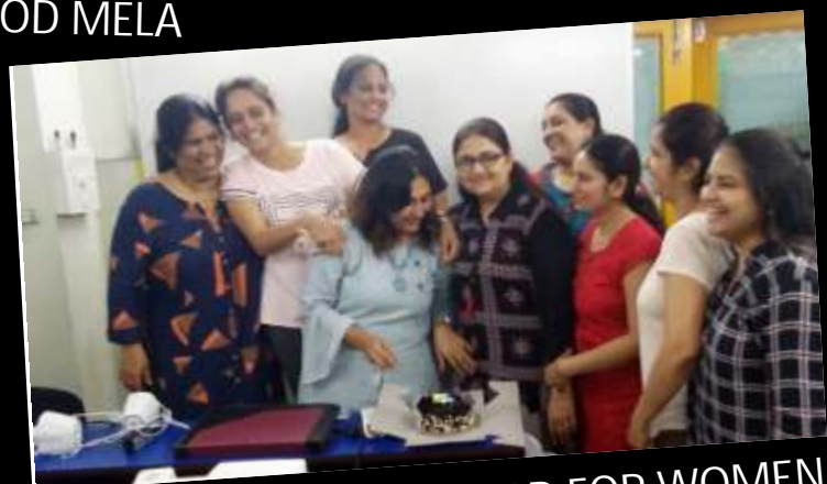
PD FOR WOMEN