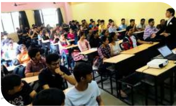
Seminar at Entrepreneurship at Atharva College