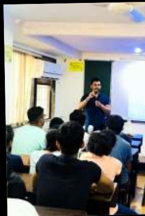
DIET, FITNESS & NUTRITION