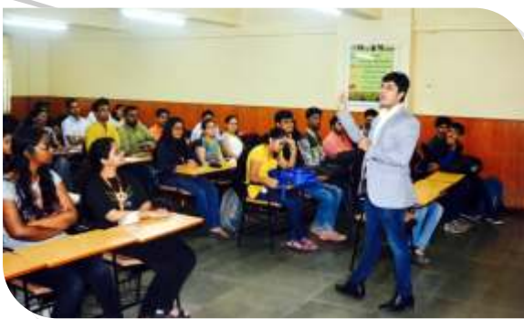
Seminar at SFIT