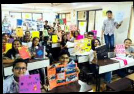
DREAM & GOAL PLANNING