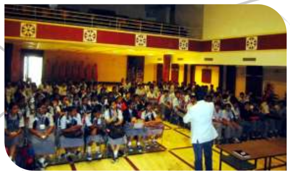
career Guidance at Khar Education Society School