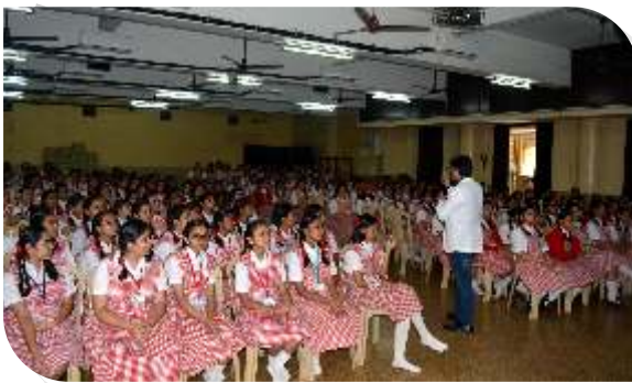
Seminar on Effective Studying Methods at St. Anne's High School