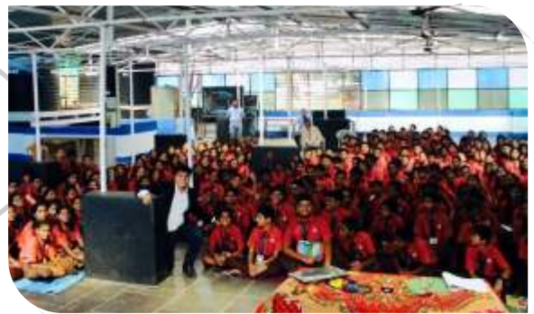
Seminar at Ramkrishna School