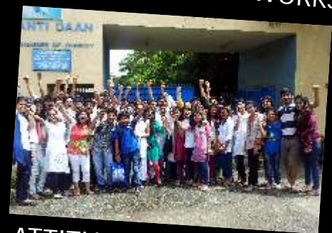
ATTITUDE OF GRATITUDE