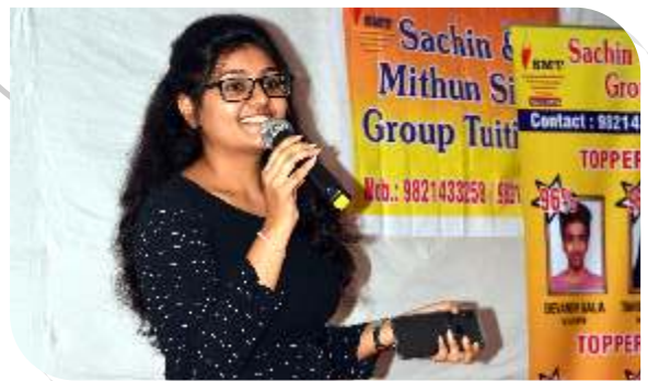
career Guidance & Motivational Seminars for various institutes