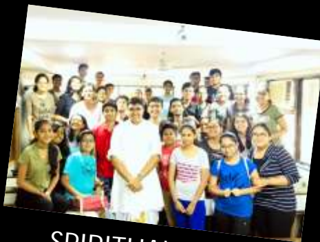
SPIRITUALITY & LIFE