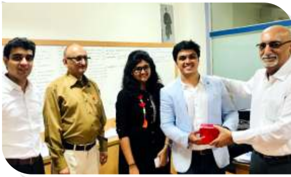
Career Workshop at SPIT