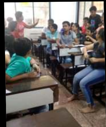
GROUP DISCUSSIONS & DEBATES