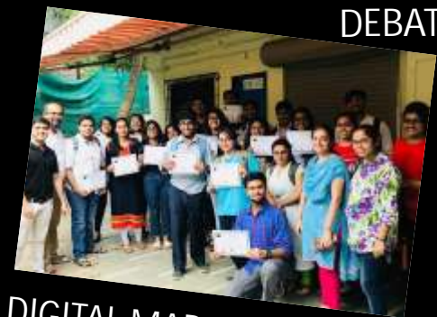
DIGITAL MARKETING WORKSHOP