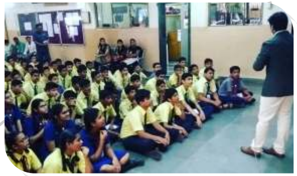
Motivational Seminar at SVP School